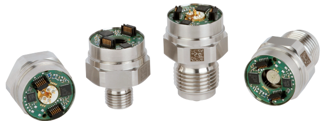
Examples of the model TI-1 OEM pressure transducer