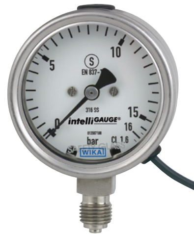
intelliGAUGE Model PGT23.063